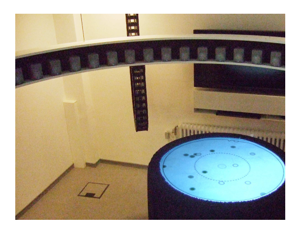
Figure 1: The wave field synthesis lab room with the circular speaker array and the multi-touch table in the center.

refers to established audio software interfaces. Furthermore, there seems to be no multi-touch functionality implemented on the tablet, although the mapping is similar to a tabletop device.