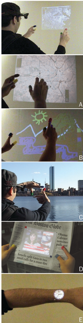
figure 2. WUW applications

for calibration, the hardware is at reach from the users, and the device has to be as large as the interactive surface, which limits its portability; nor does it project on a variety of surfaces or physical objects. It should also be noted that most of these research prototypes rely on custom hardware and that reproducing them represents a non-trivial effort.